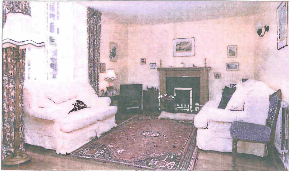
Clockwise from main: The rear garden; the hall, the kitchen; the living room